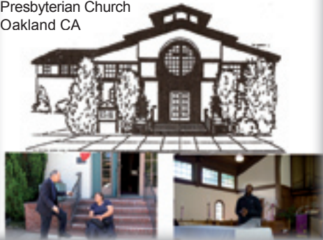
College Avenue Presbyterian Church Oakland CA

Email: wardstothers@cten.org Website: www.quonstothers.com